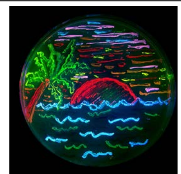
The diversity of genetic mutations is illustrated by this San Diego beach scene drawn with living bacteria expressing 8 different colors of fluorescent proteins.

While GFP remains the most “well known” fluorescent protein, there are limitations to the colors that can be generated by mutating the gfp gene. Other sources of fluorescent proteins have been sought – and found – resulting in even greater diversity of fluorescent proteins.