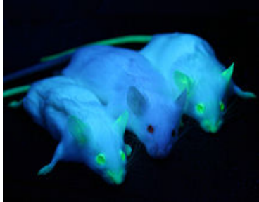
Mice expressing GFP under UV light (left & right), compared to normal mouse (center).